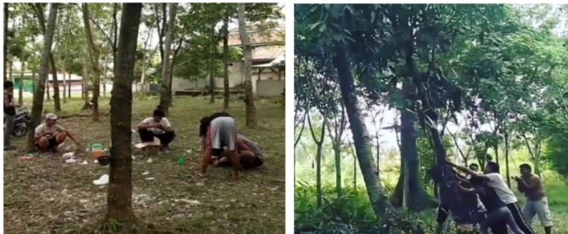
Image 1. The community cooperation in Pulau Semambu Tourism Village

The community directly gained the following benefits: 1) farmers could sell their goods above the market price because their crops were for used for vegetables picking and fruit harvesting activities; 2) traders can open stalls and benefit from the visitors' businesses; 3) Local businesses often catered for the visitors' meal and snacks.