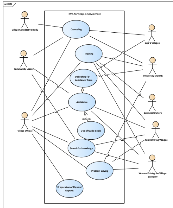
Fig. 2. Use Case Diagram for Knowledge Management System

as use cases associated with these actors. As the main actors in this model, the village officials related to the extension, mentoring, training, problem-solving, knowledge-seeking, and report preparation activities.