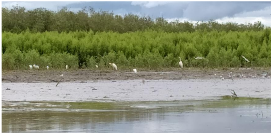
Fig. 2. Crabs habitat of migratory birds ground at Berbak-Sembilang National Park

On the substrate, fine black mud was found with a depth of 60 to 100 cm. The results of the environmental parameter measured salinity was 27 to 29 psu, temperature was 29 to 30°C, pH was 6.08 to 6.2, nitrate and phosphate were 6.69 and 0.197 mg L -1 .