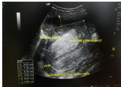
Figure 1. Ultrasound examination showed complete uterine rupture

In addition, laboratory findings showed mild anemia (hemoglobin 10.2 g/dL), increased leukocyte (12,830/mm 3 ), normal platelet (388,000/μl), increased fibrinogen (486.0 mg/dL), increased D-dimer (7.12 mcg/mL), and increased hsCRP (26.0 mg/L). Besides that, urinalysis was positive for epithelia, bacteria and mucous. Ultrasound examination showed intrauterine fetal demise, complete uterine rupture on lower segment, and free fluid on abdominal cavity (Figure 1).