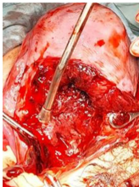
Figure 2. Intraoperative finding showed extended uterine wound