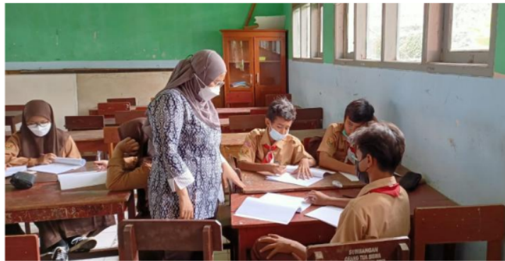
Figure 4. Small group stage

After revising the one-to-one and expert review results, the second prototype was obtained, and then a small group phase was carried out. In the small group stage, the number of subjects is 12 students with various abilities, as seen in Figure 4.