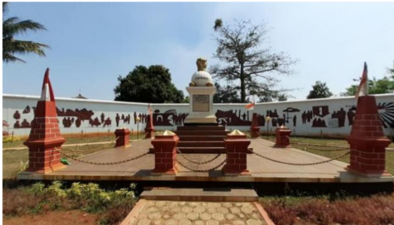
Figure 1. The monument of determination

In Karawang, a well-known building is called the monument of determination and the home of Soekarno's exile. Figure 1 shows the monument of determination which presents the visual of the building containing several shapes. Therefore, the monument of determination and the home of Soekarno's exile uses as the context for developing the PISA-like questions.