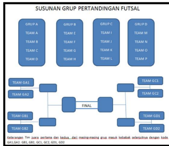
Figure 3. Example of a Competition System Match Chart

Furthermore, the example of a competition system match chart shown in Figure 3.