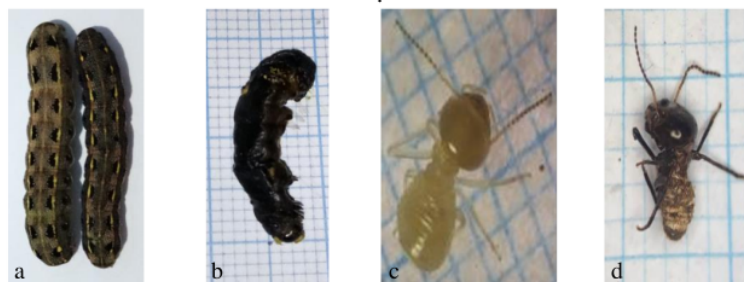
Figure 2. Symptom of death on tested insects; (a) healthy S.litura ; (b) dead S.litura ; (c) healthy C. curvignathus ; (d) dead C. curvignathus .

increased after 7 d after application. These results were supported by [18], which stated that on the first day of application, test insects experiencing symptoms of slow motion and decreased appetite. On the 2 nd day, larvae began to inactive, dead and showed brownish-green appearance. Lastly, on the 3 rd day to the 7 th day of application, insect experiencing death. The symptoms of B. thuringiensis infected larvae were started from movement declining, then followed by decreasing appetite and if it was touched the larvae did not respond. All the larvae that died in this study had the same symptoms, such as the change of color to pale brown and gradually became darker, the body of the larvae shrank and gave off a foul odor. The body of larvae infected with B. thuringiensis bacteria will turn reddish-brown and the next day the larva's body will turn black [19].