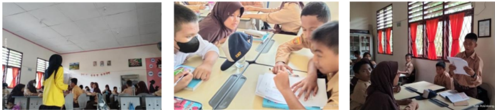
(a) (b) (c) Figure 1. (a) Learning process; (b) Student activity; (c) Student presentation

The learning process was implemented at the implementation stage in two sessions after the instrument had been improved and deemed valid. The Pendidikan Matematika Realistik Indonesia (PMRI) technique was used at the first meeting to utilize worksheets as a learning medium. The teacher will present the worksheets to the class and then instruct them to discuss and resolve the issue as indicated in (a) and (b). As seen in figure (c), the teacher will ask several student representatives to present and respond before concluding with a statement from one of the students. The crew was requested to assist the researchers by acting as observers in each group. Observations were made to ensure learning using the PMRI