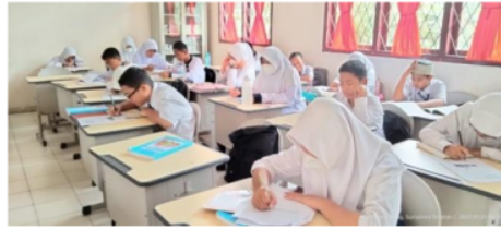
Figure 2. Field Test on PISA-like mathematics problems

Figure 2 shows that students were given creative thinking skills test questions. After the students' test results were obtained, the researchers interviewed three students based on the low, medium and high categories.