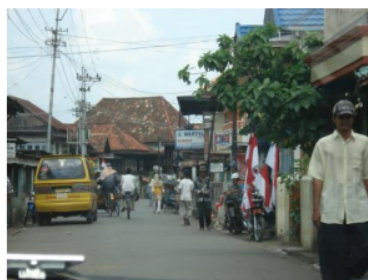
Fig 3. Road transportation in 3-4 Ulu