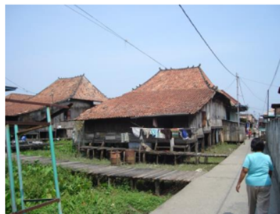
Fig 1. Limas Houses in 3-4 Ulu Palembang

Kampong 3 – 4 Ulu is a traditional settlement, it is shown by a lot of traditional houses which are more than 100 years old. The most type of houses is Limas House and has unique characters as Palembang traditional house. Limas house mostly is a house for noble or high class community. Some of the Limas Houses are still in a good condition, but some of them are in bad condition due to lack of maintenances. Preservation of these building is so urgent to reduce more severe damaged of the old buildings. The distance between the buildings is very tight and cause less environmental healthy. Under the stilt houses are not exposed the sunshine and become moist. It is also caused by an unhealthy lifestyle, such as throwing the trash or household waste to under the house. This area is also passed by several small rivers which flow to Musi river and it influent the orientation of the building in the pass. These small rivers are used as transportation and water supply for daily used.