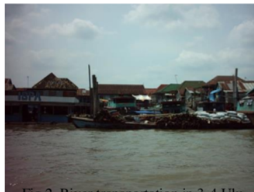
Fig 2. River transportation in 3-4 Ulu

The transportation modas that generally used by the residents are river transportation and land transportation (road). For area of 3 – 4 Ulu Laut, people usually use boat with machine (motor boat) as a means of transportation since this area is along the riverside of Musi river, meanwhile for area of 3 – 4 Darat, people use becak and car which passing through KH. Ansyari street.