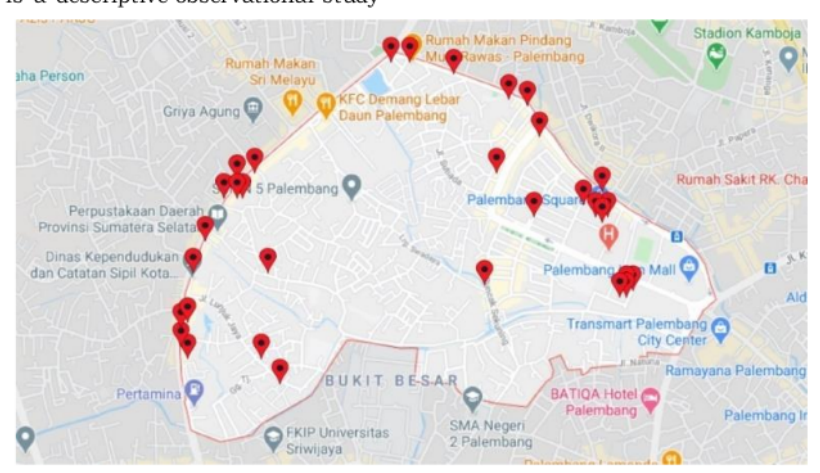
Figure 1. Map of the location of street food stalls and restaurants where raw vegetables were sampled in Lorok Pakjo Village, Palembang.

This research is a descriptive observational study