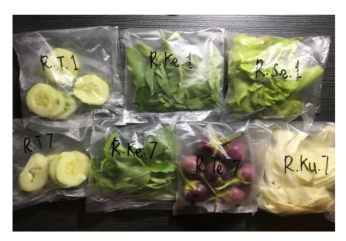
Figure 2. Types of raw vegetables served at street food stalls and restaurants in Lorok Pakjo Village, Palembang.

observations made at the Biooptics Laboratory and Medical Chemistry Laboratory, FK Unsri, from 80 samples found there were 20 positive samples contaminated with STH eggs and 60 other samples showing negative results.