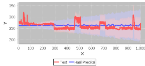
1 Figure 3. Comparison between actual and predicted consumption of electricity