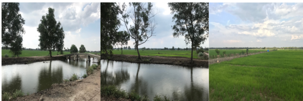
Figure 1 Tidal swamplands in Muara Telang, South Sumatra, Indonesia.

The primary data were collected through face-to-face interviews with the farmers. The 150 farmers were chosen by a simple random sampling technique since the area is similarly affected by tidal water. Some questions regarding the farmers' socioeconomic situation were addressed, i.e., age, education, household size, farm size, and farming experience. This study also covered several agricultural input use information such as seed, fertilizer (nitrogen, phosphor, and potassium), and chemical (herbicide, pesticide, and fungicide).