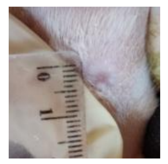
Figure 2. Wound healing in spray gel treatment

healing and significantly (p<0,05) considerable wound healing if than negative control. Table III also showed that placebo significant differences exist among positive control. This show that placebo of spray gel does not accelerate to wound healing process. Then, extract, F1, F2, and F3 no significant differences than positive control.