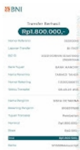
STI October 2022 Payment Receipt.jpeg 47K