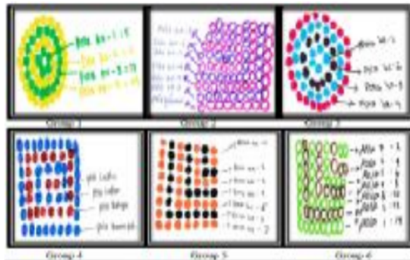
Figure 2. students painting paper arrangement circle

In the third activity, this activity aims to define the elements of numbers much paper circle pattern on the pattern of the 1st, 2nd, 3rd and so on, as well as determine the rules that form of the pattern. Of Question 3 had they had painted, in this activity they determine how much paper a circle formed of each pattern, then once they know a lot of painting circles arranged in each pattern, the students define a rule that is formed from the pattern so that they can determine the numbers The next of the rules. Based on the answers of students that we show below shows all the groups could correctly answer these problems, students can determine the rules of the pattern of numbers which they set in the previous activity. Here are the results of the students' answers to the problem number 4 on 3 activity.