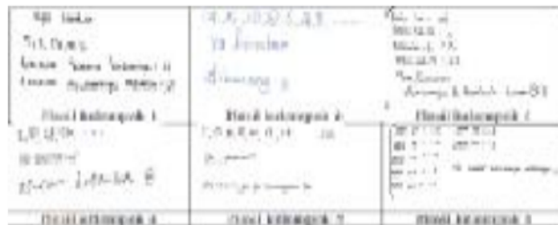
Figure 3. the results of the students' answers no 4

In the third activity, this activity aims to define the elements of numbers much paper circle pattern on the pattern of the 1st, 2nd, 3rd and so on, as well as determine the rules that form of the pattern. Of Question 3 had they had painted, in this activity they determine how much paper a circle formed of each pattern, then once they know a lot of painting circles arranged in each pattern, the students define a rule that is formed from the pattern so that they can determine the numbers The next of the rules. Based on the answers of students that we show below shows all the groups could correctly answer these problems, students can determine the rules of the pattern of numbers which they set in the previous activity. Here are the results of the students' answers to the problem number 4 on 3 activity.