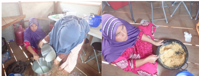
Figure 3. Processing of sagon puan (Photo taken by Takashi Tsuji on August 30, 2021)

Gulo puan is processed by heating milk mixed with sugar until there is no moisture, and sagon puan is more powder-like (Figure 3). Jelly is also heated during production, probably to prevent lactose intolerance [3] or milk contamination. People do not drink raw milk because this research found that some people find the taste or smell of milk repulsive. Jelly is a relatively new product made in 2018 to support the nutrition of children who dislike milk and to create local products under the joint project of the University of Sriwijaya, the Peatland Restoration Agency (Badasan Restorasi Gambut), and the Ibnul Fallaah Foundation (Yayasan Ibnul Fallaah).