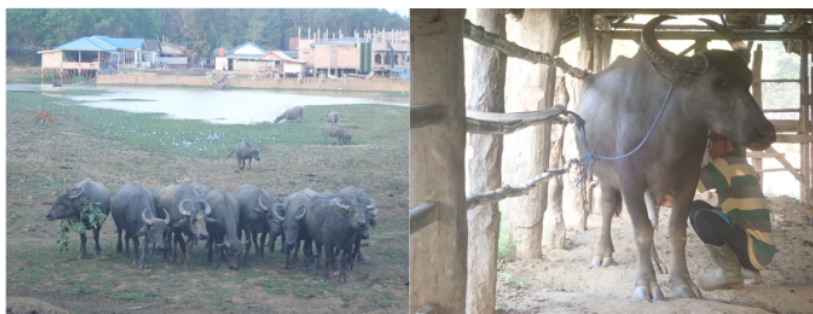
Figure 2. Grazing and milking of domestic water buffalo (Photo taken by Takashi Tsuji on August 29–30, 2019)

Water buffaloes were gathered in large cages and grazed in groups. Grazing starts at approximately 6 am and finishes at approximately 6 pm. Grazing was performed after milking (Figure 2). The grazing areas were forests, meadows, and riverbanks. During the rainy season, water buffaloes are grazed on flood plains, and boats are used to control them. There have been 14 types of feed grass reported, including para grass ( Brachiaria muticum ), rice grass ( Leersia hexandra ), and Garnotia acutigluma .