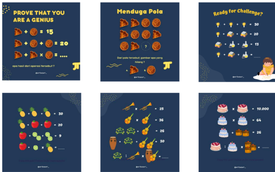
Figure 2. Infographic Display on Instagram Sub Algebra Addition Material

Figure 2 shows the results of the media script writing step, at this step it has also entered the prototyping stage, namely the production step for display on Instagram. Beside that production step is the step where everything that is arranged in the design will be produced or implemented into a media. Before being tested on students for the seventh step, this infographic will be validated first to 1 material expert and 1 media expert to see the feasibility of the infographic being developed as a learning media. Judging from the data from the validation test results by material experts, the percentage of the overall result obtained is 93%. Based on the eligibility criteria that have been determined, it can be said that infographics through Instagram as a strengthening of students' understanding are included in the valid and appropriate category for use in the learning process. The responses from material experts are: improvements to writing errors. Then for the data from the media expert validation test results, the percentage of the overall results obtained is 94%. Based on the eligibility criteria that have been determined, it can be said that infographics through Instagram as a strengthening of students' understanding are included in the valid and appropriate category for use in the learning process. The responses obtained from the media expert validation test are: improvements to writing errors and the addition of a task sub menu in the highlight section.