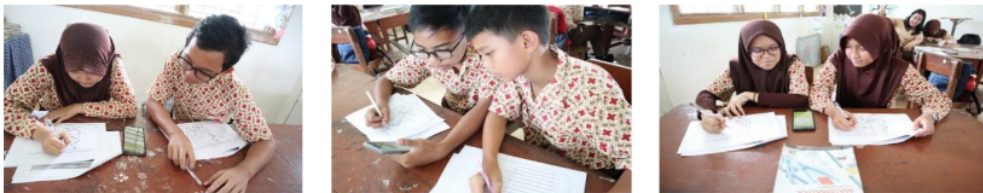
Figure 3. The Learning Process of The Students using Instagram Sub Algebra Addition Material

Furthermore, field trials were carried out with 25 students with heterogeneous abilities participating. The results of field trial data analysis, the overall percentage obtained is 90%. Based on the eligibility criteria that have been determined, it can be said that infographics through Instagram as a strengthening of students' understanding are included in the valid and appropriate category for use in the learning process. The following Figure 3. Is the picture of the learning process when students used the Instagram Sub Algebra Addition Material.