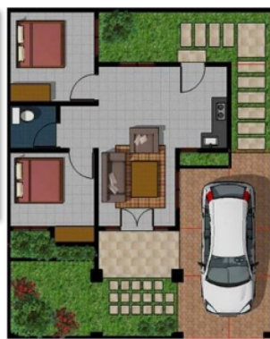
Figure 3. Garage plans