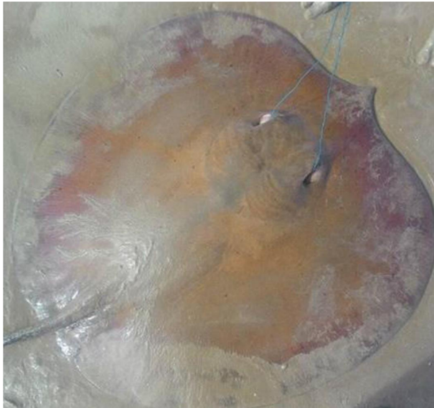
Figure 1. The specimen of Urogymnus dalyensis caught on 24 December 2017 at Lampu Satu beach, Merauke district, Papua province, Indonesia (Photo: Lham Jr).

The ray were immediately determined as Urogymnus dalyensis by combination of major features and its distributional range.