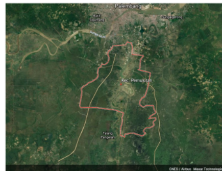
Fig. 1. Research of sites, Pemulutan District, South Sumatra, Indonesia

The Likert scale has used to measure attitudes, re-