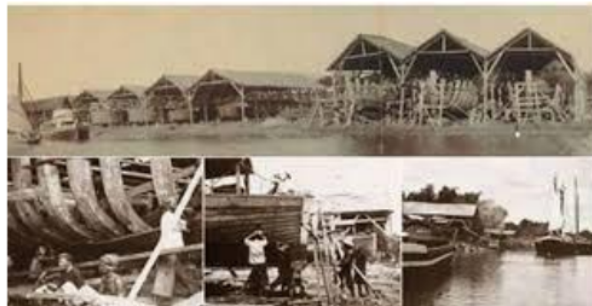
Picture 11. Kambang Putih Port