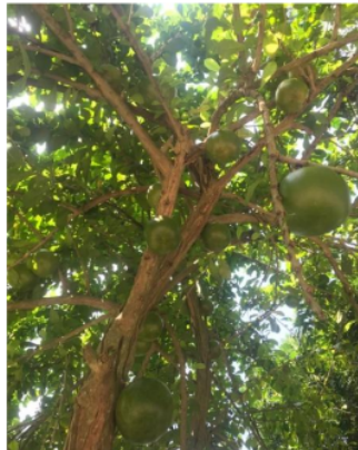
Picture 1. Maja Tree

Indonesia has a long history that can reach the present, both local and national history, history itself certainly has its own meaning for each region. One of them was during the Hindu-Buddha kingdom, in the Nusantara there was one kingdom called the Majapahit kingdom. The Majapahit Kingdom is a large kingdom on the island of Java. This kingdom has a lot of history and was one of the great kingdoms in the Nusantara at that time.