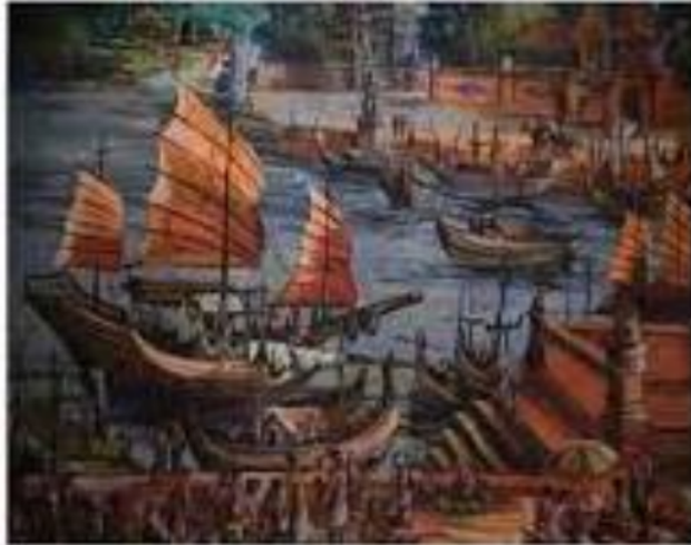
Picture 10. Cangu Port Picture