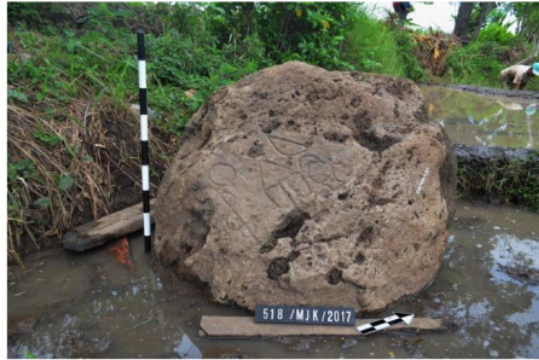
Picture 12. Trailokyapuri/Jiyu inscription

In addition to maritime or sea transportation which could support trade from the agricultural products themselves, there was also land transportation that supported trade as well as the advancement of agriculture in Majapahit at that time, namely, using human power itself and animal power. This can be evidenced by the reliefs of temples found in East Java that have been formed such as stretchers, poles, trains, and also using animal power (Rizqianto et al., 2021).