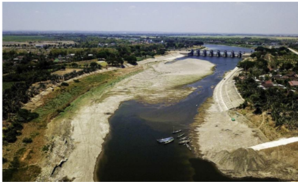
Picture 2. Bengawan Solo River