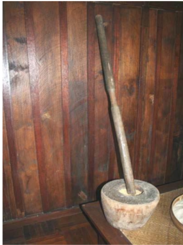
Picture 4. Mortar and Pestle