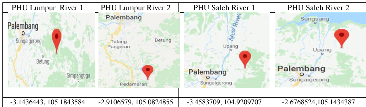
Figure 1. Locations of the SESAME stations used in this study.

This study used the TRMM 3 hours precipitation data for a period of 1 July 2017 to 31 March 2018. In addition, the SESAME data observed from 4 locations: PHU Sungai Lumpur 1, PHU Sungai Lumpur 2, PHU Sungai Saleh 1, and PHU Sungai Saleh 2 for a period of 1 July 2017 to 31 March 2018. The locations of this study shown in Figure 1.