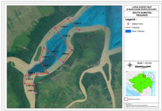
Figure 1. Map of research site.

This research was conducted in March and May 2019 in mouth of Banyuasin River, South Sumatra Province.