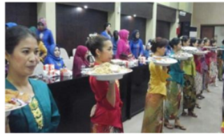
Figure 2. The socialization of vegetarian activities in the provincial government of SumSel organized by IWAPI Palembang