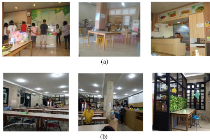
Figure 5 . The arrangement of consumer chairs and tables at Hao Xing Fu Restaurant and Padmamula Restaurant

Restaurants Hao Xing Fu and restaurants Padmamula equally setting up chairs and dining table consumer visitors lined up and is next to the counter and storefront buffet cuisine making it easier for consumers to take food and give the conveniences waitress / waiter in doing good service to consumers, as well as makes it easier for consumers to make transactions at the restaurant's cashier. In addition the waiters and restaurant attendants can see the customers who come up clearly. The interior decoration of Hao Xing Fu Restaurant and Padmam ula Restaurant can be seen in Figure 5 .