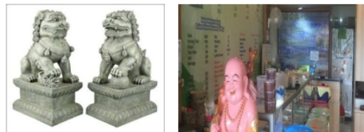
Figure 4. Decorative statues at Padmamula Restaurant (left) and at Hao Xing Fu Restaurant (right) become the choice of the management of each restaurant

Based on field observations of these two vegetarian restaurants, there is no doubt that vegetarianism in Palembang City still highlights the characteristics of worship and the symbols of Buddhist konghucu religion, so as to limit the visit for the general public. Chinese ethnic decorations are also seen on the front yard of Padmamula Restaurant, where there is a Buddhist temple site in the form of a lion statue with an instrument of worship. Picture illustration of the prayer statue displayed in the yard of Padmamula Restaurant and the prayer statue inside the Hao Xing Fu Restaurant can be seen in Figure 4 below.