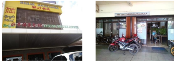
Figure 3 . Front view of Hao Xing Fu Restaurant and Padmamula Restaurant

Based on field observations of these two vegetarian restaurants, there is no doubt that vegetarianism in Palembang City still highlights the characteristics of worship and the symbols of Buddhist konghucu religion, so as to limit the visit for the general public. Chinese ethnic decorations are also seen on the front yard of Padmamula Restaurant, where there is a Buddhist temple site in the form of a lion statue with an instrument of worship. Picture illustration of the prayer statue displayed in the yard of Padmamula Restaurant and the prayer statue inside the Hao Xing Fu Restaurant can be seen in Figure 4 below.