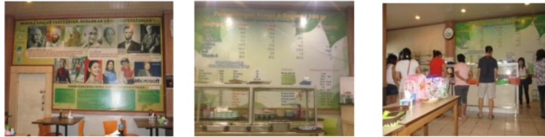
Figure 6 . Restaurant Decoration Hao Xing Fu

diners. This is done by the management of Restaurant Hao Xing Fu and Padmamula, for example by displaying the poster benefits of vegetable and other vegetable products. However, at Padmamula Restaurant, there were no famous vegetarian poster figures, the management of Padmamula Restaurant prioritizes the number of vegetarian dishes on offer rather than decorating the restaurant attractively. But recently Padmamula Restaurant changed the layout of the buffet window and the checkout counter. Where the cashier desk is now on the right of the restaurant entrance and given a table and a waiting chair for consumers who buy food using an online motorcycle taxi service . Can be seen in Figure 6 below.