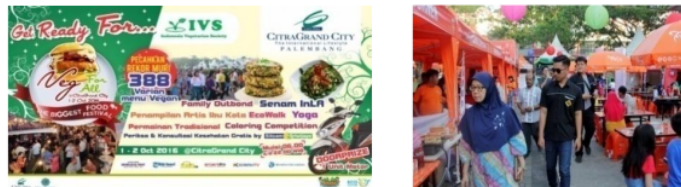
Figure 1. Vegetable based food bazaar titled " Veg For All " organized by Indonesia Vegetarian Society (IVS) Kota Palembang.

The implementation of the vegetarian food bazaar and vegetarian seminar in Palembang City is not often held. Implementation of the latest plant-based bazaar was held on October 1-2, 2016 at Citra Grand City Housing with the theme " Veg For All " many enthusiastic visitors visiting various booths that present 300 variants of plant foods. Show that plant foods can be made into a variety of foods.