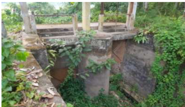
Figure 2. Condition of the Rantau Panjang irrigation dam

The Rantau Panjang irrigation channel which winds through several villages, namely Rantau Panjang village, Karang Anyar village and Sukarame village, Lawang Wetan sub-district, Musi Banyuasin district (Figure 1).