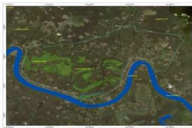
Figure 1. Sketch of Rantau Panjang irrigation in Lawang Wetan Musi Banyuasin District

The Rantau Panjang irrigation channel which winds through several villages, namely Rantau Panjang village, Karang Anyar village and Sukarame village, Lawang Wetan sub-district, Musi Banyuasin district (Figure 1).