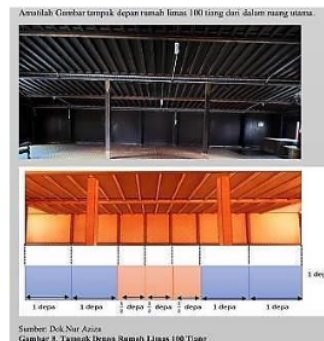
Figure 9. Activity 4

The front wall of this 100 pillar Limas house has 5 walls that can be opened. Students are directed to analyze the length and width of the wall as shown in Figure 9.