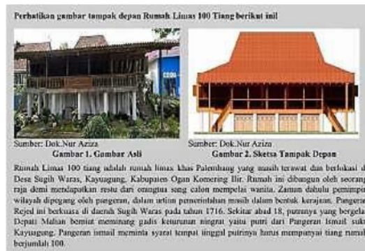
Figure 5. Activity 1

The uniqueness of limas house is that it has 100 pillars and each floor in the room has a different height and the height difference is the same. The learning activities are in Figure 6.