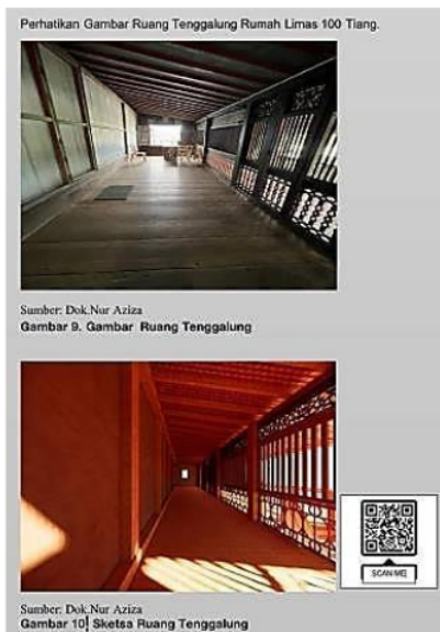
Figure 10. Activity 5

Another uniqueness of this 100 pillar Limas house is that it has a room in the shape of a trapezoidal prism. Therefore the researcher directs students to first analyze the names of the mathematical shapes in that space as shown in Figure 10.