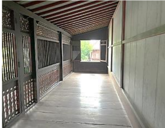
Figure 1. Tenggalung Room in the form of trapezoidal prism

DOI: https://doi.org/10.24127/ajpm.v11i4.6207