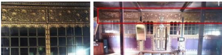
Figure 4. Carving wall of 100 pillars house

combination of jasmine flower, cape flower, chrysolite which are flanked by bamboo. The existing carve is chiseled and painted. The motive of simbar /tendrill symbolize the description of water community/water ripple, while the motive of jar is the symbol of imperial gift. In the room, there are also dragon carving in the form of specific abstract of Palembang which is usually found in Limas house. The carving is made of gold foil in new wood, painted with gold paint can be seen in Figure 4.