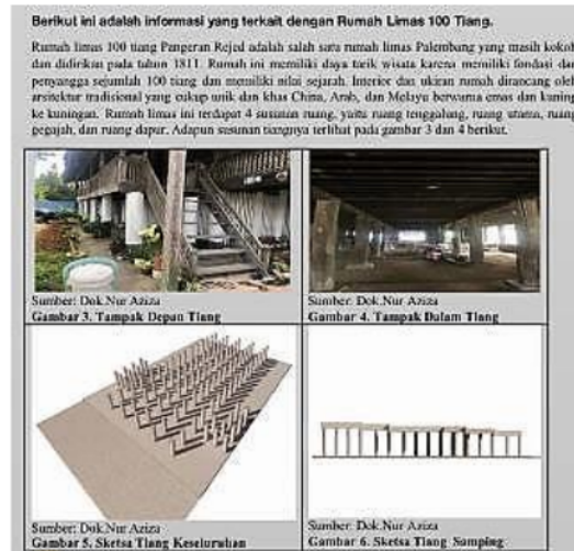
Figure 6. Activity 2