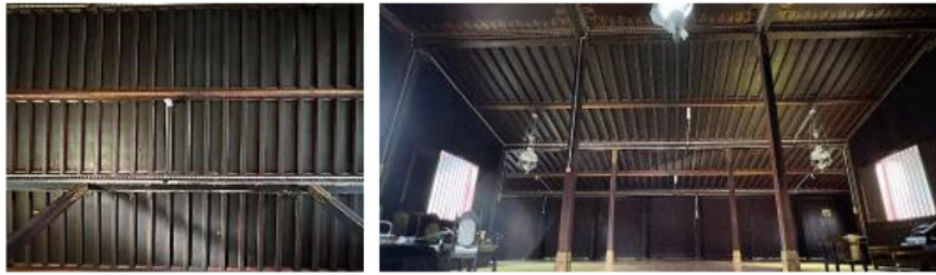
Figure 3. Plafond of 100 pillars house

DOI: https://doi.org/10.24127/ajpm.v11i4.6207