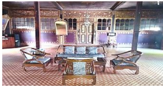
Figure 2. Living room of 100 pillars house

the upper part of tenggalung room. In the past, this room is used as women's zone, as the weaving place and as seclusion place.