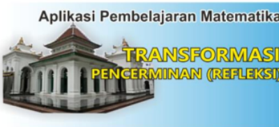
Figure 5. Display of Reflection Sub Material

The fourth application is a mathematics learning application for the transformation of reflection sub-materials, https://www.geogebra.org/m/dh7pjmj , the application display is shown in Figure 5.