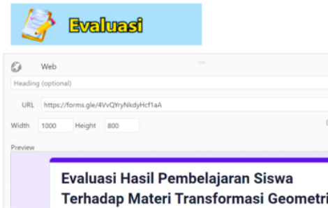
Figure 6. Display of evaluation questions 1000 x 800 pixels