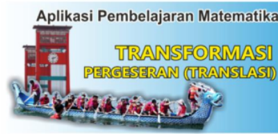
Figure 2. Display of Sub Translation Materials

The second application is an application for learning mathematics with transformation materials with dilated sub-materials, https://www.geogebra.org/m/absxnb4b , the application display is shown in Figure 3.