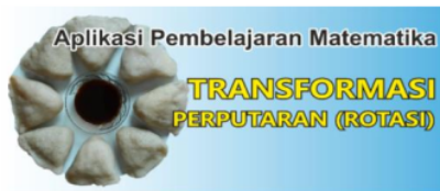
Figure 4. Display of Sub-Rotation Materials

The third application is a mathematics learning application for the transformation of rotational sub-materials, https://www.geogebra.org/m/upyt7wnw , the application display is shown in Figure 4.