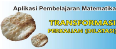
Figure 3. Display of Sub Dilated Materials

The second application is an application for learning mathematics with transformation materials with dilated sub-materials, https://www.geogebra.org/m/absxnb4b , the application display is shown in Figure 3.