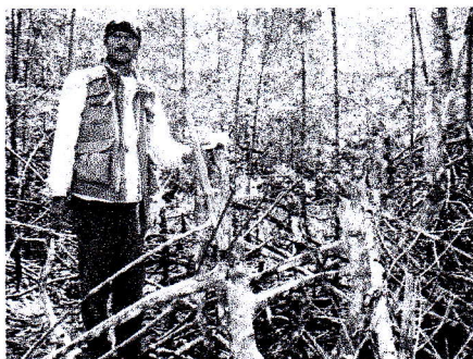
Figure. 3. Illegal logging of mangrove forest at Pulau Ruku, INHIL.