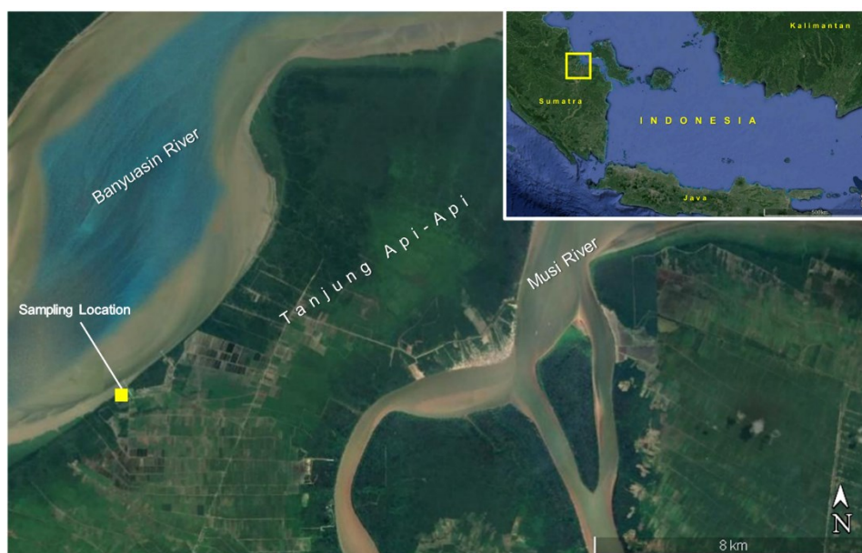
Figure 1. Mangrove sampling location in Tanjung Api-Api, South Sumatra

The Tanjung Api-Api mangrove area is wide with various species that dominate, including R. apiculata , A. alba , A. marina , and S. caseolaris (3,4). Based on geographic location, the sampling location was located in the intertidal area with coordinate positions S 2.3715833 and E 104.8041083 and had a fairly busy domestic port activity (Figure 1). This area has thick mud with fertile mangrove habitat and another benthic organism (4,16,17). This area is also influenced by the dynamics of water quality parameters, where it is a mixing area between a large mass of fresh water from the Banyuasin River and a mass of salt water from the Bangka Strait, forming a very large brackish area (18–20). This condition certainly supports the mangrove habitat's growth in this area.