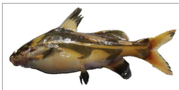
Figure 2 The morphology of Dukang fish ( Bagroides melapterus )

Dukang fish's body shape is elongated. The body is yellow and black. Has no scales. It has dorsal, pectoral, pelvic, anal, and caudal fins. The dorsal and pectoral fins develop hard juries into Patil. The thorns are very sharp and jagged. On the back of the back, there is a fat fin (adipose fin). The morphology of the Dukang fish is shown in Figure 2. The weight of this fish can reach 2 kg per fish.