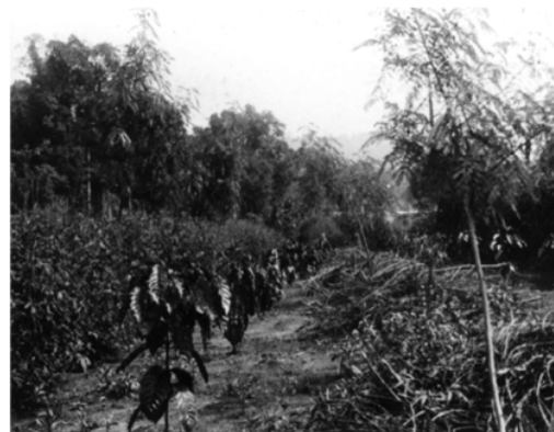
Figure 3. Robusta Coffee in Pasemah, Palembang