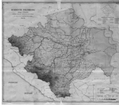
Figure 1. Palembang Residency in 1922

The abundant natural wealth in Uluan is the consideration of Palembang as a prosperous city. This is because the city serves as a gathering point for various Uluan commodities, emphasizing a market for imported products from several global