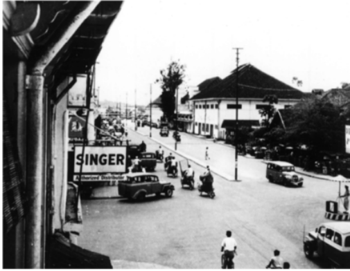
Figure 7. Tengkuruk Road (Former Tengkuruk River)