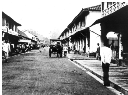
Figure 6. Road of Palembang