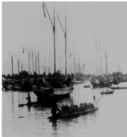
Figure 4. Traditional Ship of Uluan People in 1930

From the early 1900s to the mid-20th century, agricultural and mining commodities in Uluan region were subjected to swift growth due to the increasing market demand. This indicated that Palembang evolved into a focal point for both local and external economic activities, serving as the capital and the hub of social, commercial, and political endeavors in South Sumatra (Purwanto, 1998). The development was also reinforced by a centralized trade network within the region, facilitating the concentrated flow of export-import commodity exchanges. Furthermore, Palembang functioned as the capital of the residency since the Srivijaya era, encompassing both the kingdom and Palembang Sultanate. This historical context elucidated the Dutch colonial motivation for their persistent efforts to conquer the Sultanate. Three destructive conflicts were also observed, with Palembang being victorious twice before the Dutch ultimately captured the capital (Wargadalem, 2017). As the trading capital, Palembang subsequently had a very strategic location, due to being widely connected to other surrounding regions through large and small rivers. The city was considered a serving center for all commodities produced in Uluan region. In addition, all the products from its buffer regions, including coffee, rubber, cotton, wood, palm oil, etc, converged in the capital Palembang, which served as the focal point