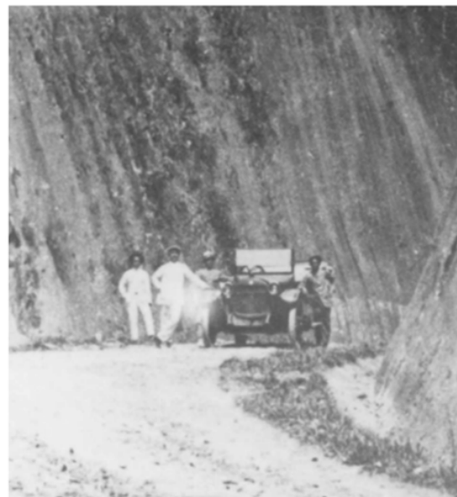
Figure 8. Road of Palembang – Pagaram

Numerous factors also contributed to the development of Palembang modernization framework. This indicated that the shift in the local populace lifestyle was the primary factor influencing the city transformation into a cosmopolitan hub due to globalization. Since Palembang had a long history of engaging in transnational activities, the transformation process was unsurprising. In the 20th century, a prominent transition was also observed from traditional to "Westernized" values, emphasizing a shift from people exclusivity toward embracing a more open orientation. This change was evident in various aspects, including the construction of grand homes by Uluan people, such as coffee and rubber farmers. The homes were also adorned with import-