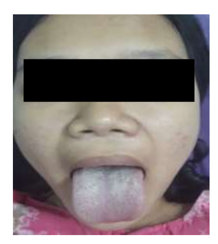
Figure 2. Image of the patient's tongue at the initial visit

Diagnosis in this case was acute pseudomembranous candidiasis, with poor oral hygiene as local predisposing factors. The use of the calcium channel blocker antihypertensive drug, Amlodipine, was acting as a systemic factor that has side effects such as reducing the amount of salivary flow by blocking the work of the parasympathetic nerves through the pathway of the calcium. Calcium ions can not enter the post synapses of the parasympathetic nerve, which is a chemical messenger for the parasympathetic nerves to stimulate the salivary glands. Reduced saliva production causes a reduction in salivary anti-candida components such as lysozyme, histatin, lactoferrin, and calprotectin, hence candida can easily develop and become a risk factor for oral candidiasis. The closest differential diagnosis is coated tongue. The clinical features of acute pseudomembranous candidiasis and coated tongue have a similarity, both showing the lesion of white-yellowish plaque that can be removed or scraped on the dorsum of the tongue. However, the coated tongue does not leave any red areas after removal, so the most appropriate diagnosis is acute pseudomembranous candidiasis.