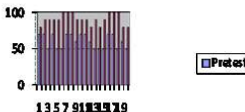
Figure3 Bar Chart Comparison Pretest and Post test Value

Furthermore, after completing second exercises, students are given a post-test to measure the potential effects after using interactive multimedia. Comparison of the value percentage of the pretest and post-test can be seen in the following figure.