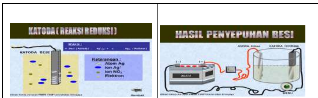
Figure 1. First prototype

Figure 1 above is the first proto type designs that represent multiple views of the electrolysis cell materials that exist on the Power Point program in interactive media animation developed by researchers