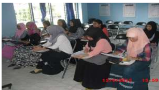
Figure 2. Student Activities Small Group Stage

The learning process is done by observation and administration of student activity questionnaire for students to ask for student feedback on the use of interactive media. The learning process that takes place can be seen in Figure 2 below: