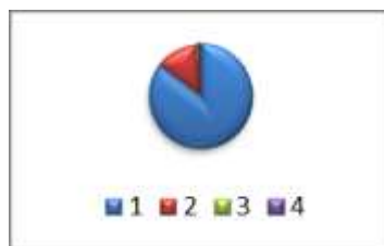
Picture 1. The Diagram Shows Percentage of Scientific Literacy Themes That Appear in Book A

The results of the analysis of the second category of scientific literacy books used in schools in the district north Indralaya can be described in the diagram below :