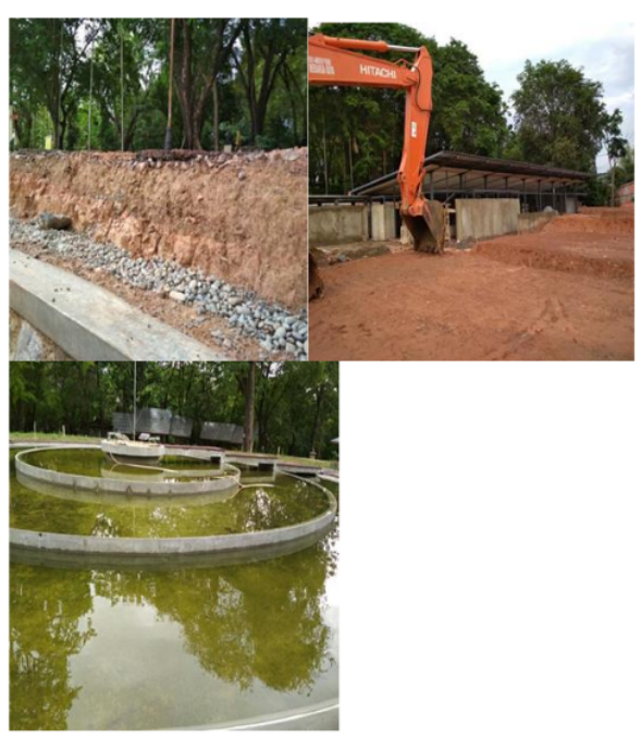
The photos were privately owned on 29 October 2017.

The idea of revitalizing Siguntang Hill as above will change the shape of Siguntang Hill from its original form. Whereas maintaining the authenticity of historical sites is very important because it can trigger and consolidate individual, community memories, increase norms, memory culture, trust, and community vitality in efforts to restore cultural heritage (Wenzhang, Song, & Feng, 2022). According to Gao and Jones (2020), historical objects, buildings, and monuments (cultural heritage) will experience birth, growth, aging, and death phases due to both natural forces and human activities. However, efforts to rejuvenate the Bukit Siguntang cultural heritage site should emphasize the principle of conservation (protection) instead of changing the site's original form.