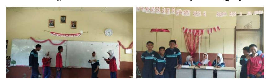
Figure 9. Presentation from visual learning style

Finally, in the dimension of creativity, the character value evident in students is during the creation of the project. As a facilitator, the researcher only facilitates and provides input regarding the project to be created. The creation