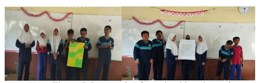
Figure 7. Presentation from visual learning style

the Pancasila student profile with its six dimensions such as faithful, devoted to the One and Only God, and noble character, independent, cooperation, global diversity, critical thinking, and creative. The implementation of the PPP strengthening project is one way to instill Pancasila values in the school environment (Sari et al., 2023). The PPP strengthening project through PBL raises awareness among students about the importance of having good character through the principles of Pancasila in the family, school, and community environment (Natalia et al., 2023).