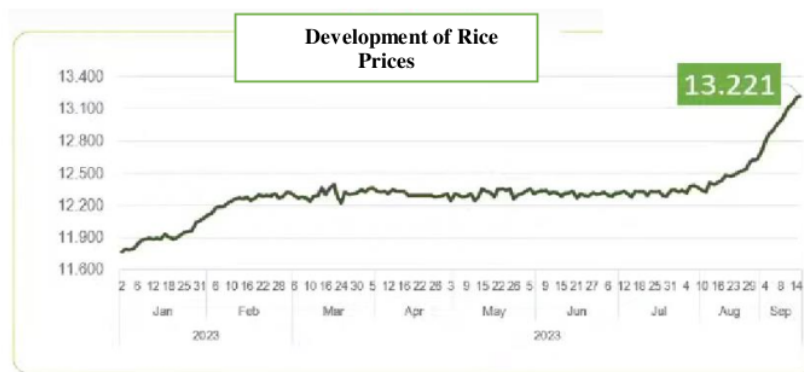
Figure 2. Rice price development