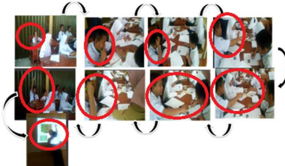
Figure 6. Low cognitive student responses to Ethnomathematics based learning.

Based on Figure 6 the results of the analysis of learning and understanding of material low cognitive students feel happy about the way the teacher applies mathematics learning using the context of oil palm cultivation, able to understand concepts and solve flat field material problems using the context of oil palm cultivation, and students are motivated to learn mathematics, although at first the student showed gestures that seemed to dislike the material, but during the discussion he showed that he wanted to know by asking friends of his group, and finally could solve the problem himself, even he was confident to present the answer in front class of his own accord (Figure 6).