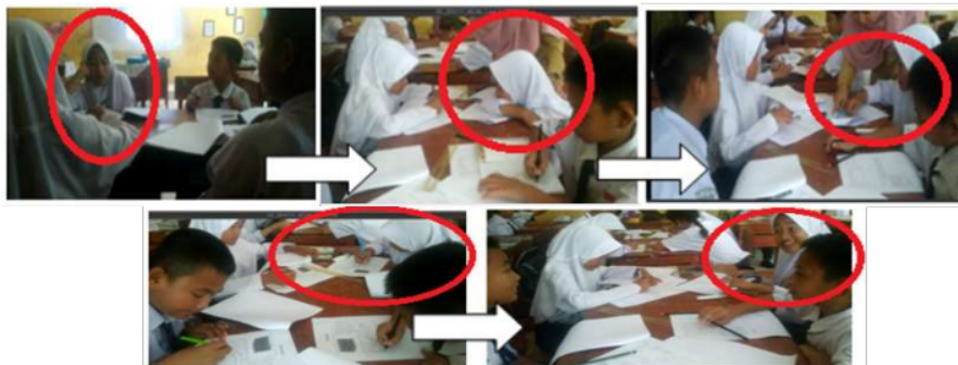
Figure 4. Student responses are being towards Ethnomathematics based learning.

Based on Figure 4, the results of the analysis of learning and understanding of material cognitive students are fulfilling all the indicators of response to feel happy about the way the teacher applies mathematics learning using the context of oil palm cultivation, able to understand concepts and solve flat field material problems using the context of oil palm cultivation, and students are motivated to learn mathematics even though initially cognitive students are causing a lot of gestures that show expressions of difficulty in solving problems, cognitive students are also asking for help from their friends to understand him and his friends respond well, and cognitive students are still not understanding, then the teacher start approaching the student and ask where the difficulty is, then the teacher gives an explanation of the difficulties experienced by the cognitive student being, and the student starts working and shows a happy expression of being able to finish his work.