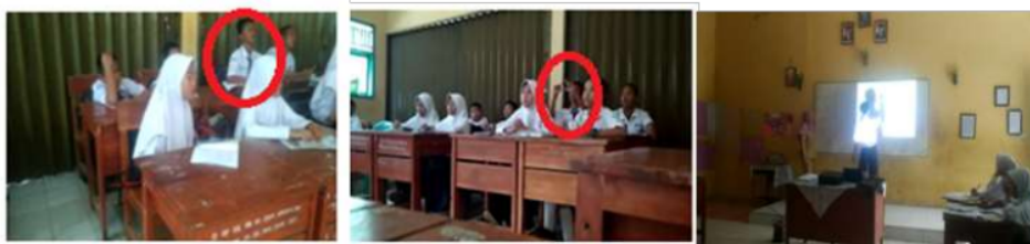
Figure 2. High cognitive student responses to Ethnomathematics based learning.

Based on Figure 2 the results of the analysis of learning and understanding of material high cognitive students meet all the response indicators, namely cognitive students feel happy with the way that teachers apply mathematics learning using the context of oil palm cultivation, high cognitive students are able to understand concepts and solve flat field material problems using context oil palm cultivation, and students are motivated to study mathematics.