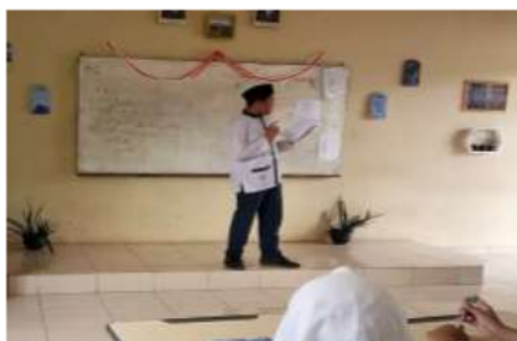
Figure 1. Subject AB Presents Results of Group Discussion.

group to solve problems. All subjects tended not to respond or respond to the opinions of other students while discussing the results of the presentation and evaluating the results of the presentation of other groups, except AR subjects and IN subjects who tended to comment to evaluate the results of the discussion even though the answers of the subjects were almost similar. The subject also tended not to present the problem solving results of the group discussion in front of the class, this is because the subject was embarrassed and afraid to present the answer alone. Only AB subjects who seemed enthusiastic and brave to appear alone when asked to present the results of their group discussions even though the subject AB appeared alone in front of the class. In line with [20] which shows that at the evaluation stage of learning the subject is reluctant to ask because the subject tends to follow the flow and tends to approve the material that was taught.