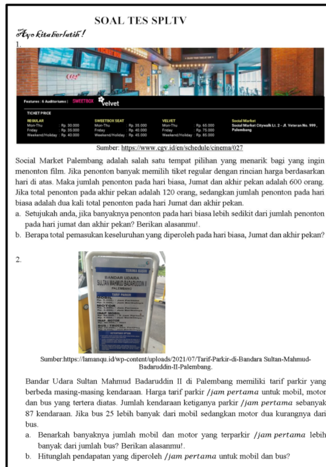
Figure 6. Test Questions

In the context of the results of the C4 level test questions, this research found significant variation in the emergence of relational understanding indicators among students: the first indicator appeared in 22 individuals, the second in 33, the third in 27, the fourth in 33, and the fifth in 32. However, only 16 people included all indicators, affirming the findings of Hanifah et al. (2019) regarding the difficulties students have in applying relational understanding in a comprehensive manner. To overcome this challenge, this research supports the previous approach by Alfiana & Dewi (2021) and Putra et al. (2018) that suggested the use of LKPD to enhance the understanding of mathematical concepts.