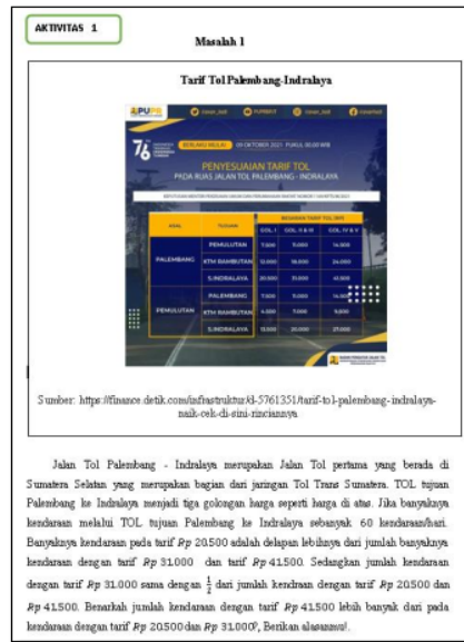
Figure 4. Problem in LKPD 2

An example answer from a student in Group 3 is shown in Figure 5.