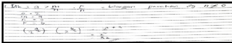
Figure 4. NAN's answer to problem 1

Figure 4 shows that NAN on the problem 1 which as a whole has not been able to use exponential definitions and rules in conducted proof, according to [16], students' difficulties in constructing evidence are often due to students' lack of understanding of the prerequisite material, definitions and certain rules that are used as components in proving something. This can be seen from the students' answers from each step of the answer