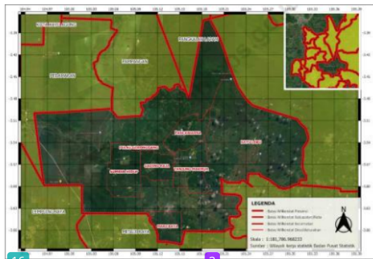
Fig 1: Map of the study site for the length-weight relationship and condition factor of Notopterus notopterus (Pallas, 1769) from East Pedamaran Sub-district, Ogan Komering Ilir Regency, South Sumatra, Indonesia

This research was conducted in the Floodplain area of Kayu Labu Village, East Pedamaran Sub-district, Ogan Komering Ilir District, South Sumatra, Indonesia (Fig 1). East Pedamaran Sub-district is one of subdistricts in Ogan Komering Ilir Regency which distance about 72 km to capital of regency. It is located in south east capital of regency. East Pedamaran Sub-district has 10 meters from surface of sea level, and total area is 671.11 km 2 .