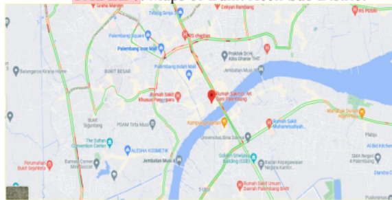
TABLE 7. Maps of Bukit Kecil Sub District