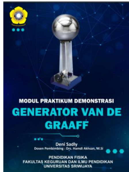
Figure 2. Practicum Module Cover

The draft is prepared by sorting practicum activities and the components presented in the practicum guide, namely as follows: 1) Practical guide cover, 2) Foreword, 3) Table of contents, 3) List of Tables, 4) Introduction consisting of Motorized Van de Graaff Generator and how to clean the Van de Graaff Generator, 5) Practicum activities consist of sub-chapters: practicum objectives,