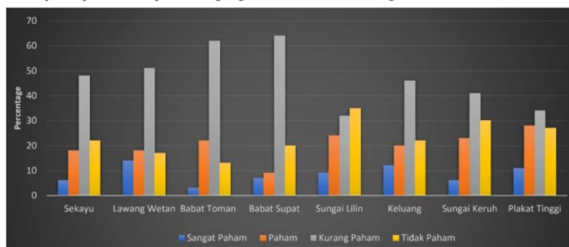
Diagram 1. Palm Oil Workers' Understanding of Labor Regulations

The problem was investigated using interviews and focus group discussions, and significant aspects of the phenomenon of difficult working conditions for palm oil workers were found, including their understanding of regulations and participation in implementing regulations as shown in diagram 1.