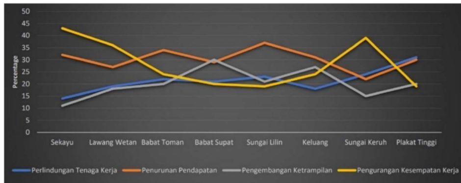
Diagram 3. Impact of Labor Regulations on the Welfare of Palm Oil Workers in Musi Banyuasin

The implementation of labour regulations has a significant impact on the sustainability of the livelihoods of palm oil workers in Musi Banyuasin Regency, covering various aspects such as minimum wages, social security, occupational health and safety, and workers' rights (Eliza, 2021). In reality, workers' understanding and implementation of labour regulations by stakeholders is still weak, which has an impact on the welfare of palm oil workers, as presented in diagram 3 below.