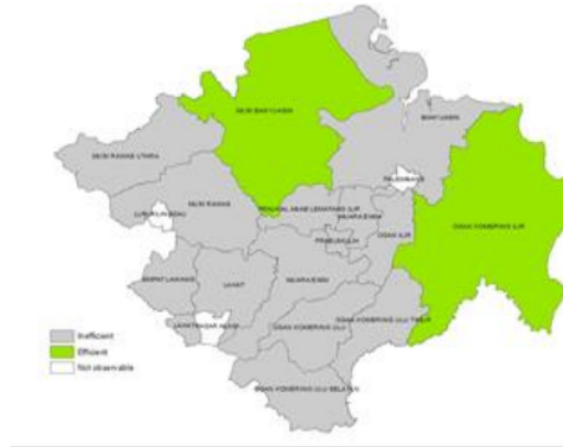
Fig. 1. Areas of Reference 4

The value of efficiency based on the VRS method shows slightly different results compared to the CRS method. Table 4 confirms that in some districts a number of input factors will increase the output as it occurs in the districts of Ogan Komerang Ilir and Ogan Komerang Ilir. When viewed by year of observation the results are more varied, the value of efficiency in the year 2015 is in Musi Banyuasin Regency, Ogan Komerang Ilir, Prabumulih City, South OKU. Then, in 2016, the value of efficiency was achieved in Musi Banyuasin Regency, Ogan Komerang Ilir, South OKU and Penukal Abab Lematang Ilir. Entering the year 2018, the composition of the area that has efficiencies in Musi Banyuasin, Ogan Komerang Ilir, Prabumulih and South OKU.