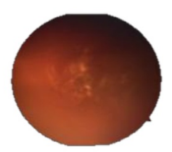
Figure 1. Fundus Imaging of Right Eye Before Surgery

First day postoperative there was increased in visual acuity to 6/60 with a posterior segment that could be assessed, obtained tortous blood vessels, slight bleeding and ghost vessel in the superotemporal area with laser injury.