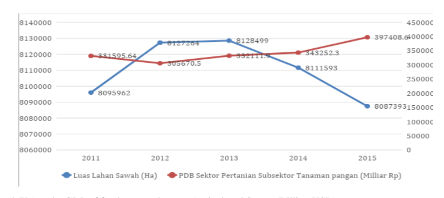
Fig. 1. Land (Ha) and a GDP of food crops subsector Agricultural Sector (Billion USD)

Statistics show that the foreign debt position of Indonesia in agriculture, livestock, forestry, and fisheries in April 2019 amounted to 10,228 Million USD. [12] external debt is an important financial source that is primarily used to supplement domestic resources to support the development and other needs of a country. Typically, the foreign debt incurred by a country which suffers from a lack of domestic savings and foreign exchange needed to achieve development and other national objectives. However, if the external debt is not used in incomegenerating activities and productive, the ability of debtor countries to pay off debts is significantly reduced.