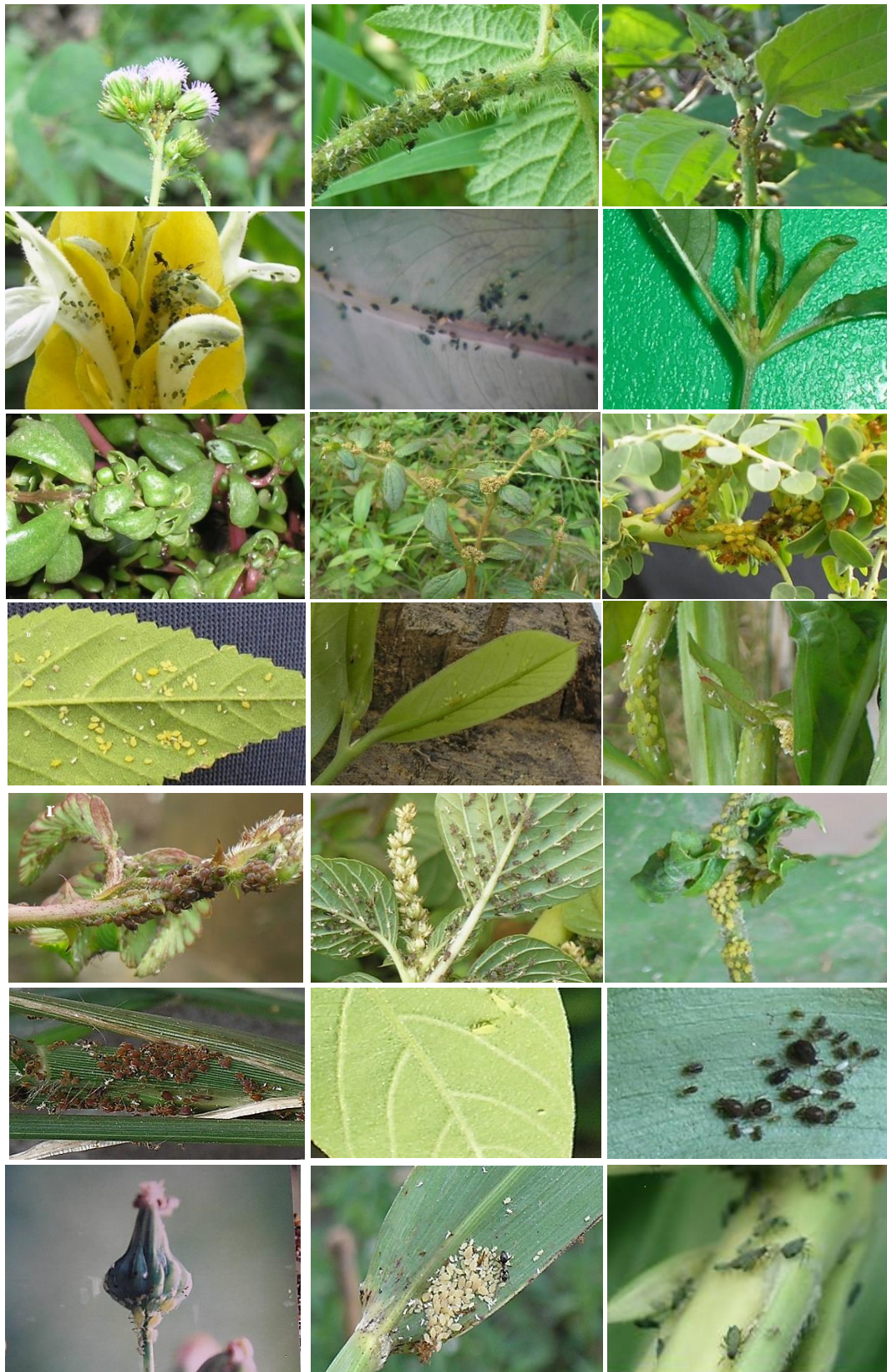
Figure 2. Aphids found on wild plants a) A. gossypii on the weed Ageratum conyzoides , b) A. gossypii on Croton weed hirtus c) A. gossypii on the weed Eupatorium odoratum , d) A.gossypii on plants Pachystochys sp., e) A.gossypii on plants Caladium sp., f) A. gossypii on the weed Alternanthera sessilis , g) A.gossypii in Portulaca oleraceae weeds, h) A.gossypii on the weed Euphorbia hirta , i) A. citricola on the weed Phyllanthus nerruri , j) A. citricola on Sida rhombifolia weed, k) A. citricola on plants Annona muricata , l) A.citricola on the weed Ludwigia peruviana , m) A. craccivora on Mimosa pudica weed, n) A.craccivora on weeds Amaranthus gracilis , o) A. glycine in Mikania micrantha weed, p) Hysteneura sp. in Eleusine indica weeds, q) Greenidae sp. in kenidai trees (shrubs) indica , r) Hyperomyzus sp. in Echinocloa crusgali Weed, s) L. erysimi on weed sonchus arvensis , t) Rhopalosiphum rice on the weed Oryza rufipogon , u) Rhopalosiphum Maidis on the weed Oryza rufipogon .