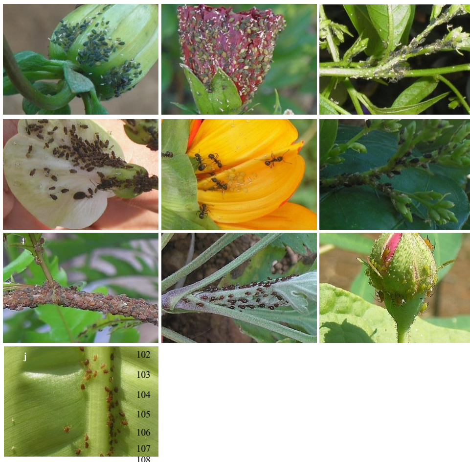
Fig 1. The location of aphid colonization on various plant parts. a) A. gossypii in D. Kelvin flower b) A. gossypii in H. rosasinensis flower c) A. gossypii in tuberose flower, d) A. craccivora in Clitoria ternatea flower, e) A. citricola in Helianthus sp., f) A. aurantii on the M. paniculata flower, g) T. odinae in the S. dulcissoland , h) Uroleucon sp. in chrysanthemums, i) Macrosiphum rosae in R. indica flower, j) Pentalonia nigronervosa in C. indica leaves

In addition, this study documented the presence of weeds, which might serve as alternative hosts for aphids (Table 2). The location of aphid colonies also varied, namely on flowers, stalks, plant tops, young leaves and old leaves of wild plants (Figure 2). The presence of specific plants or host plants within a habitat influenced the types of aphids found. Many aphid species are found on a broad range of plants or host plants, while others are highly specialized and are only found on specific plants or host plants. This is closely related to the polyphagous, oligophagous or monophagous nature of aphids (Blackman & Eastop 2000).