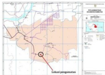
Fig. 1. Sampling location

Blood sampling place the swamp Buffalo ( Bubalus bubalis ) in the area of TanjungSenai, Ogan Ilir Distrik, South Sumatera. Separation of serum is performed in the integrated laboratory Postgraduate Sriwijaya University. The research of DNA isolation, quantification of DNA and PCR-RAPD performed in the laboratory of Biochemistry at the Faculty of biology of the Gajah Mada University.